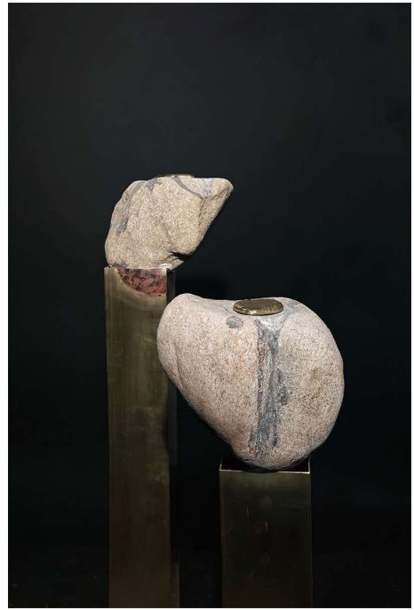
Image : Dennis Lin Untitled (Front)25×25×h90cm / (Back)25×30×h120cm

Reception Party | 2026.4.11[Sat] 5pm-7pm